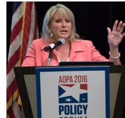
Rep. Ellmers at AOPA 2016 Policy Forum

On April 25, Representative Ellmers (R-NC-02) introduced HR 5045: Preserving Access to Modern Prosthetic Limbs Act of 2016 . The bill is "to impose a moratorium on the implementation of a proposed Medicare local coverage determination on lower limb prostheses". The bill places a moratorium until June 30, 2017 on implementing the July 16, 2015 Local Coverage Determination (LCD): Lower Limb Prostheses (DL33787). The bill also would require that CMS and its contractors remove the policy from their websites, which is necessary because private payors (United Health Care and Cigna) have been adopting provisions included in the LCD. AOPA will keep you updated on any progress.